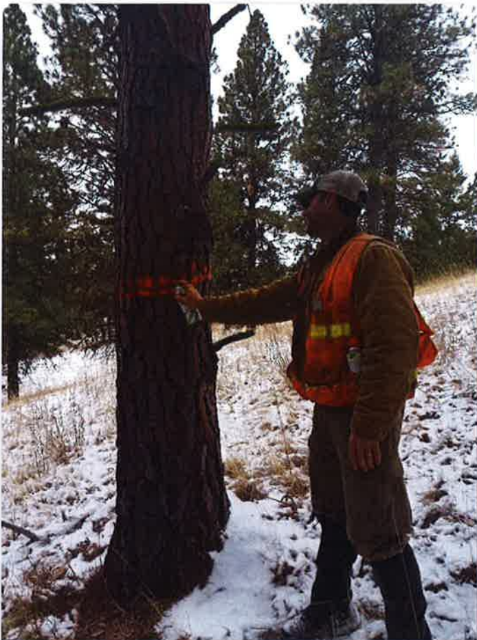
Windy-shingle harvest designation