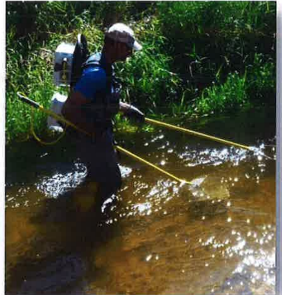
Hanna Flats stream surveys